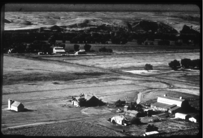
Above: This undated aerial view shows the Oahe Mission before the construction of the Oahe Dam.

Since 1877, the Oahe Chapel has been a distinctive piece of central South Dakota's history, and it is still used today for weddings, baptisms, and other special events.