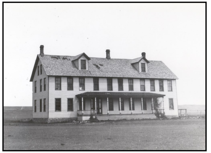
Above: The Oahe Mission also had a boarding school for a number of years.