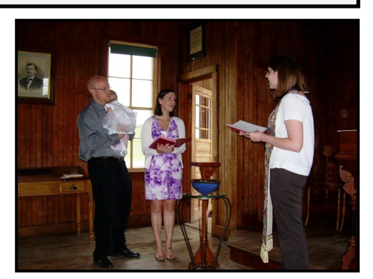
Left to right: A Sunday service in the Oahe Chapel; a wedding ceremony; and a baptism.