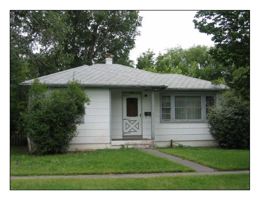
House built in the Oahe Addition in Pierre.

Oahe Dam destroyed the communities of Robertson, Four Bears, and the Cheyenne River Agency and forced the relocation of 81 families. Other sizable projects occurred on the Lower Brule Reservation and the Crow Creek Reservation when the construction of the Big Bend Dam resulted in the displacement of 62 and 27 families, respectively. Detailed information about these housing projects can be found in the Indian Housing in South Dakota: 1946-1975 historic context document prepared for the State Historic Preservation Office in 2000 (U.S. West Research, Inc., 2000).