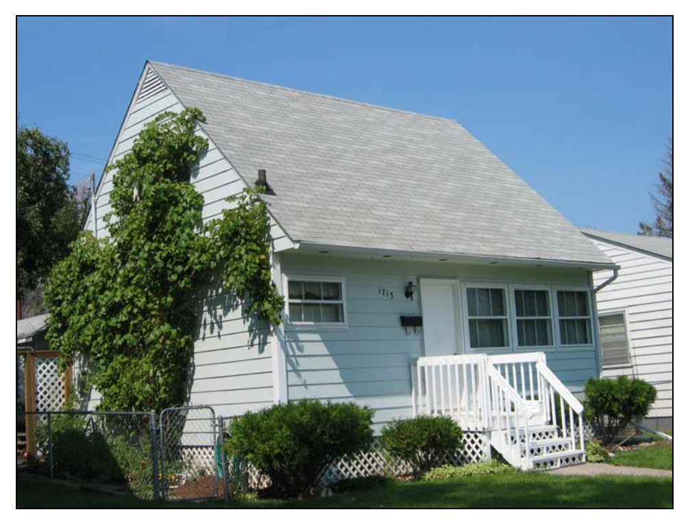
Model home for the Knecht Lumber Company's prefabricated houses.

Basement houses were also fairly common in South Dakota and examples can be found in many communities. Many of them had structures built on top (as was the original intent), although there are a substantial number of them that never did and they continue to be used as basement houses. Newspaper reports indicate that there were at least 75 basement houses constructed in Aberdeen in the years following the war, and there are numerous examples in Rapid City. They were also common in smaller towns – several were built in Canton and have been documented in a Master's thesis project at the University of Oregon.