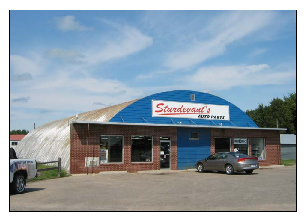
An early Quonset hut in Brookings still used for commercial purposes.

of Quonset huts that were converted to private family homes that are still in existence somewhere in South Dakota today.