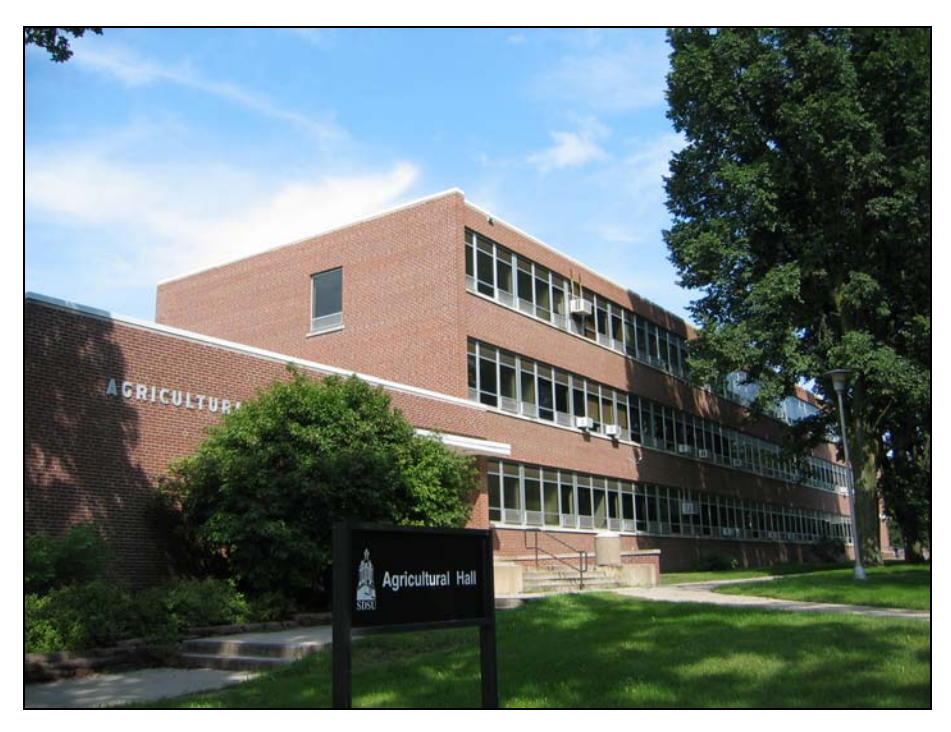
Agricultural Hall, South Dakota State University, 1949, 1956.