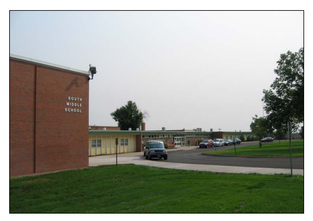
South Junior High School (now South Middle School), Rapid City, built 1959.

Several buildings were constructed on South Dakota's college and university campuses following the war; most followed suit in using Modern architectural styles and materials. At Northern State College in Aberdeen, two new residence halls, Lindberg (1954) and Briscoe (1958), and the original portion of the new Memorial Student Union (1958-60) were built. Also in Aberdeen, a new building was constructed at Presentation College in 1954.