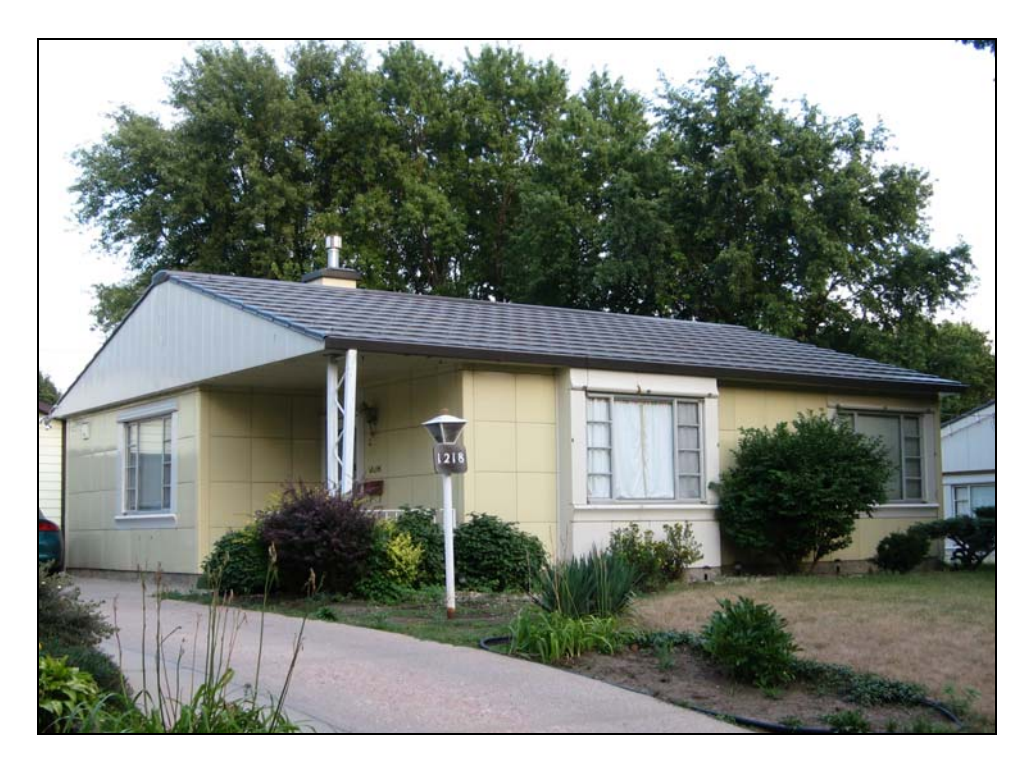
This Lustron house is located in Sioux Falls.

Other prefabricated housing was intended to be permanent and by 1947, there were 280 firms involved in the production of prefabricated housing (Lustron MPS, E3). While most of the prefabricated units utilized traditional building materials, some were more innovative. The classic example is the Lustron house developed by Carl Strandlund in 1946. Lustron houses were made of porcelain enameled steel panels, manufactured in a plant in Chicago and shipped to various sites where the enameled panels were attached to a steel frame set on a concrete slab. The single-story, gabled roof houses came in a small variety of sizes and layouts, although approximately 90 percent of all Lustrons sold were two-bedroom. Both the exterior and interior of the Lustrons were finished and the interiors were considered "ultra-modern" (at that time) with the inclusion of items such as dishwashers, built-in shelves and vanities, and sliding doors (Lustron MPS, E6-7). In addition to the houses, Lustron also offered garages constructed in the same way with the same materials (Lustron MPS, G-10). Further details about Lustron houses can be found in Lustron Houses of South Dakota Multiple Property Listing to the National Register by Michelle C. Saxman-Rogers, 1998.