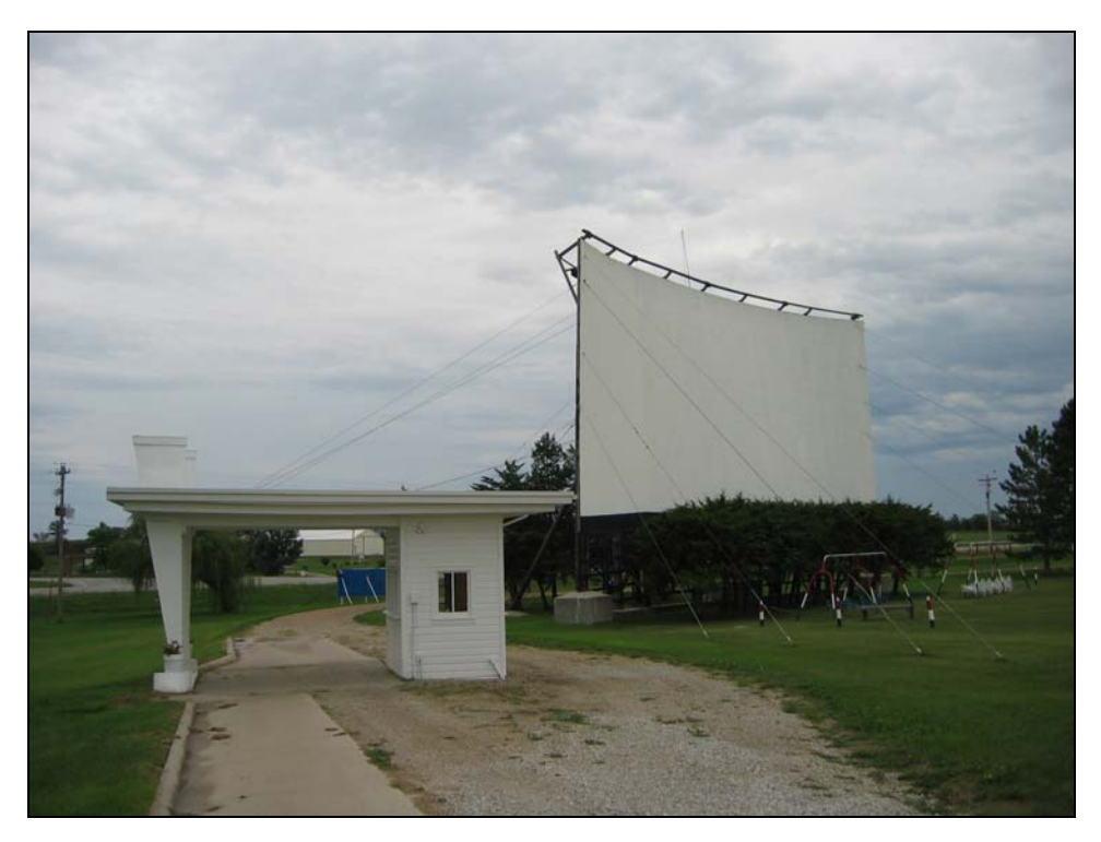
Winner Drive-In, built 1950.

In South Dakota, a number of recreational and cultural resources were constructed following the war. Dozens of drive-in movie theaters were erected throughout the state, a small number of which continue to operate today. Examples include the Midway Drive-In (1953, near Miller), the Starlite Drive-In (1949, near Mitchell), the Winner Drive-In (1950, just east of Winner), the Pheasant Drive-In (1960, near Mobridge), and the Hilltop Drive-In (1946, west of Gregory). Others are still extant, standing as relics of the times, but are no longer used. These include the PIX Drive-In (west of Winner) and the Siskota (at Sisseton).