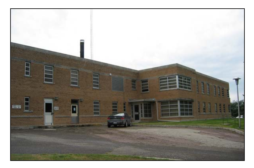
Rosebud Hospital, Winner, built 1950.

Modern nursing homes were also constructed during this time period. One example is the Clarkson Nursing Home in Rapid City (c.1955). Vermillion had the first nursing home in the nation under the Hill-Burton Act, which authorized Federal aid for construction of nursing care facilities. This nursing home was the Dakota Nursing Home, built in 1957.