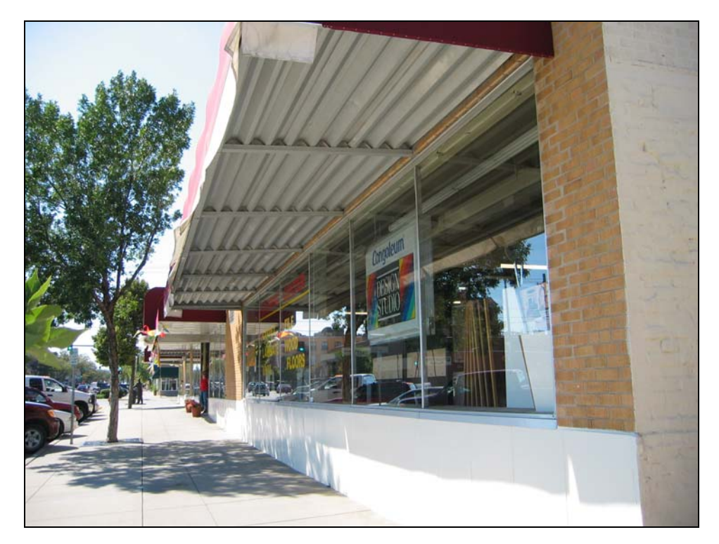
The Gambles Store, Rapid City, designed by Ewing & Forrette, built 1947.