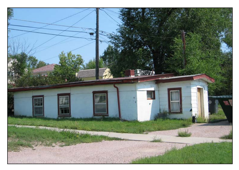
This basement house, which never had the upper floor added, is located in Rapid City.

Not only are individual houses considered potentially important resources from the postwar period, but entire neighborhoods, many developed by merchant builders in America's suburbs and subdivisions, may be of importance. Many of these developments were planned and designed to be complete neighborhoods, often with many similar homes constructed within a short period of time. The quintessential example, of course, is the Levittowns that were built in New York, New Jersey and Pennsylvania. They represent the "supersized" developments; it was far more typical to have a subdivision of 200 to 500 homes (although there are examples of all sizes in between and even smaller).