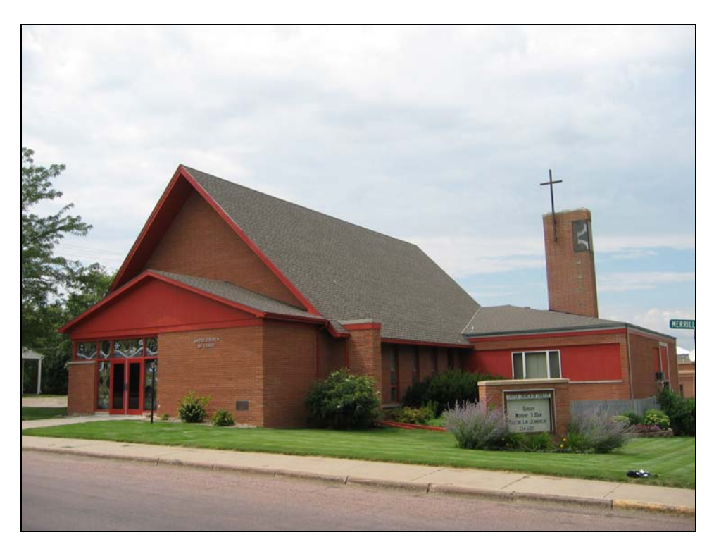
United Church of Christ, Chamberlain, 1957.

Lutheran (1949), First Baptist (1956), United Church of Christ (1957), and Trinity Lutheran (1958) churches in Chamberlain; and in Winner, the Church of the Immaculate Conception (1949; rectory 1958, parish hall 1959) and the United Methodist Church (1956).