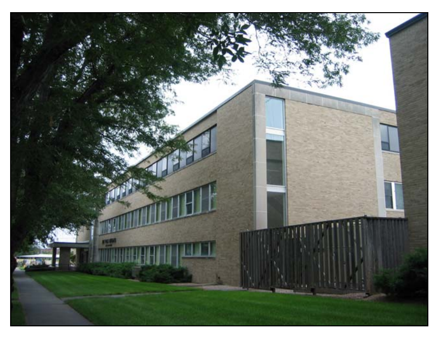
The Joe Foss Office Building, Pierre, built 1950.

A number of large public works projects were undertaken in South Dakota following the war. The most notable, perhaps, are the dams constructed on the Missouri River. They included the Ft. Randall Dam (constructed 1946-1954), the Oahe Dam (constructed 1948-1963), the Gavins Point Dam (construction completed in 1957), and the Big Bend Dam (built between 1959 and 1964). Smaller projects were also completed during this time period, including the construction of Angostura Dam, Shade Hill Dam and Pactola Dam (all in western South Dakota). Further information about the Missouri River Dams can be found in the National Register nominations for the dams.