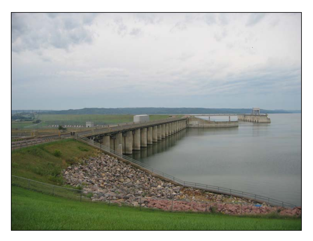
Ft. Randall Dam, near Pickstown, constructed between 1946 and 1954.

The Missouri Basin Project (also called the Pick-Sloan Plan) began in the late 1940s after construction was authorized for 150 multi-purpose reservoirs along the Missouri River and its tributaries. Several of these dams were located in South Dakota, including the Fort Randall (completed 1954), Gavins Point (completed 1957), Oahe (completed 1963), and Big Bend (completed 1964). The construction of these dams resulted in a number of housing projects, including the construction of the town of Pickstown near the Fort Randall Dam and the Oahe Addition in Pierre. Pickstown was constructed to house the workers and their families, and the community included single-family houses, duplexes and apartments, a school, a police and fire station, a post office, a hotel, and a retail shopping center. The Oahe Addition included the construction of 50 two- and three-bedroom houses and 26 garages to address the housing shortages for construction workers.