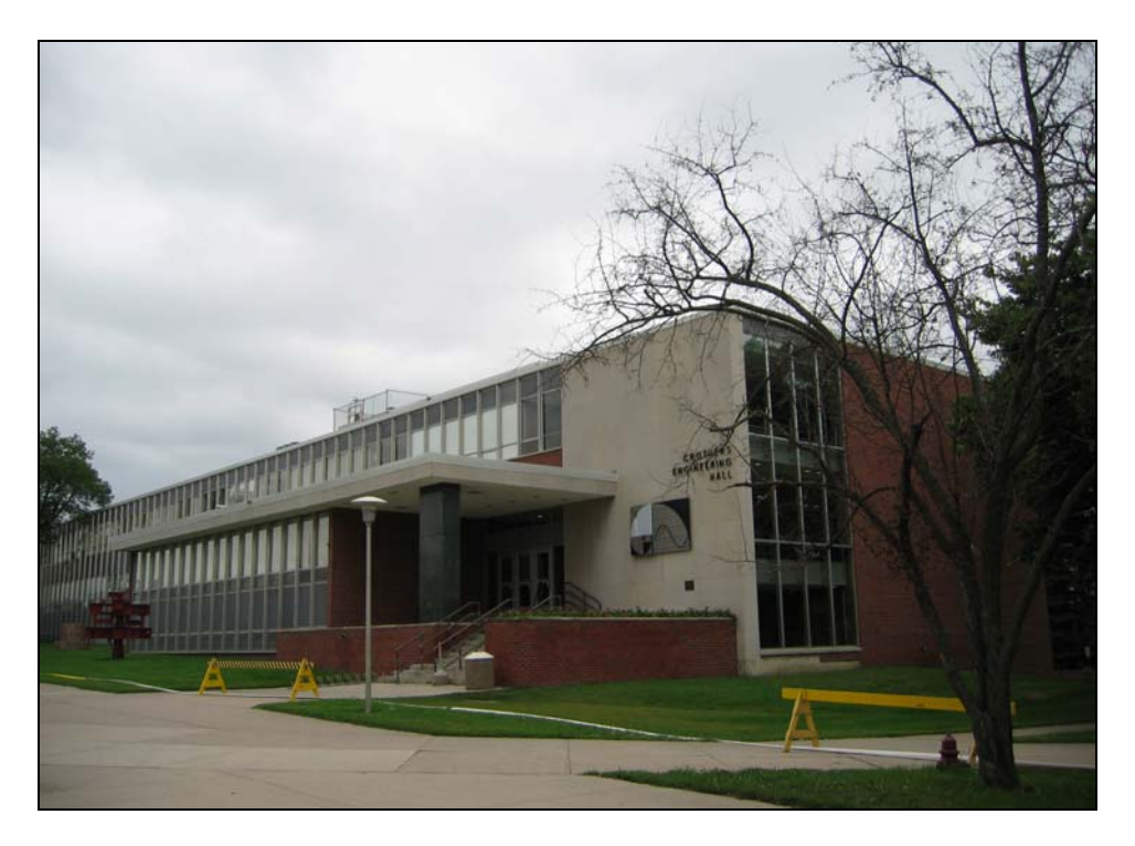
Crothers Engineering Hall, located on the South Dakota State University campus in Brookings, is an example Modern architecture's lack of ornamentation and expansive use of glass and aluminum on wall surfaces.

The Depression of the 1930s and the war during the early 1940s stalled the use of Modern architectural styles in America. Following the war, however, Modern architecture gained in popularity and became the dominant style of architecture throughout the country until the postmodern period took over in the 1960s and 1970s. Modern architecture lent itself well to the use of modern materials, including glass, steel, aluminum, and concrete, as well as to new methods of construction.