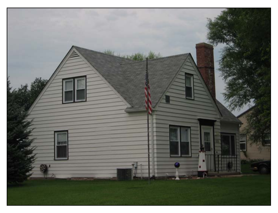
This Minimal Traditional style house was built in 1946 in Pickstown.

Residential architecture of the postwar period experienced a stylistic shift, although there was a brief effort to incorporate traditional elements in the modern styles. The Minimal Traditional style was used in the late 1940s and, in some parts of the country, into the early 1950s. More often, however, the need to build huge numbers of houses quickly resulted in a stripped down house with no ornamentation – one that could be mass-produced easily at minimal cost – which became known as Minimal Tract or Builder Tract housing. Millions of these homes were built in the late 1940s and early 1950s. By the mid-1950s, there was a shift toward larger homes and the small box-like tract housing was replaced by the Ranch Style, which dominated residential architecture in America through the following two decades. Another style also became popular in the late 1950s when the Split-Level style was introduced (McAlester, 477).