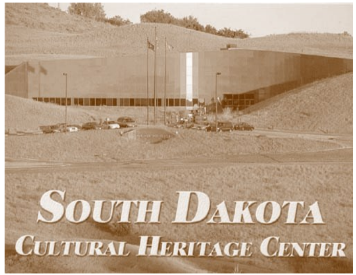
The South Dakota State Historic Preservation Office (SHPO) is located in the Cultural Heritage Center in Pierre

Park Service through grants-inaid from the revenue of offshore oil leases. These activities include the National Register, conducting historical and archeological site surveys, monitoring federal projects, and providing technical assistance and incentive programs. The National Register of Historic Places recognizes significant national, state and local properties. In South Dakota the statewide historic preservation office is the State Historic Preservation Office in Pierre.